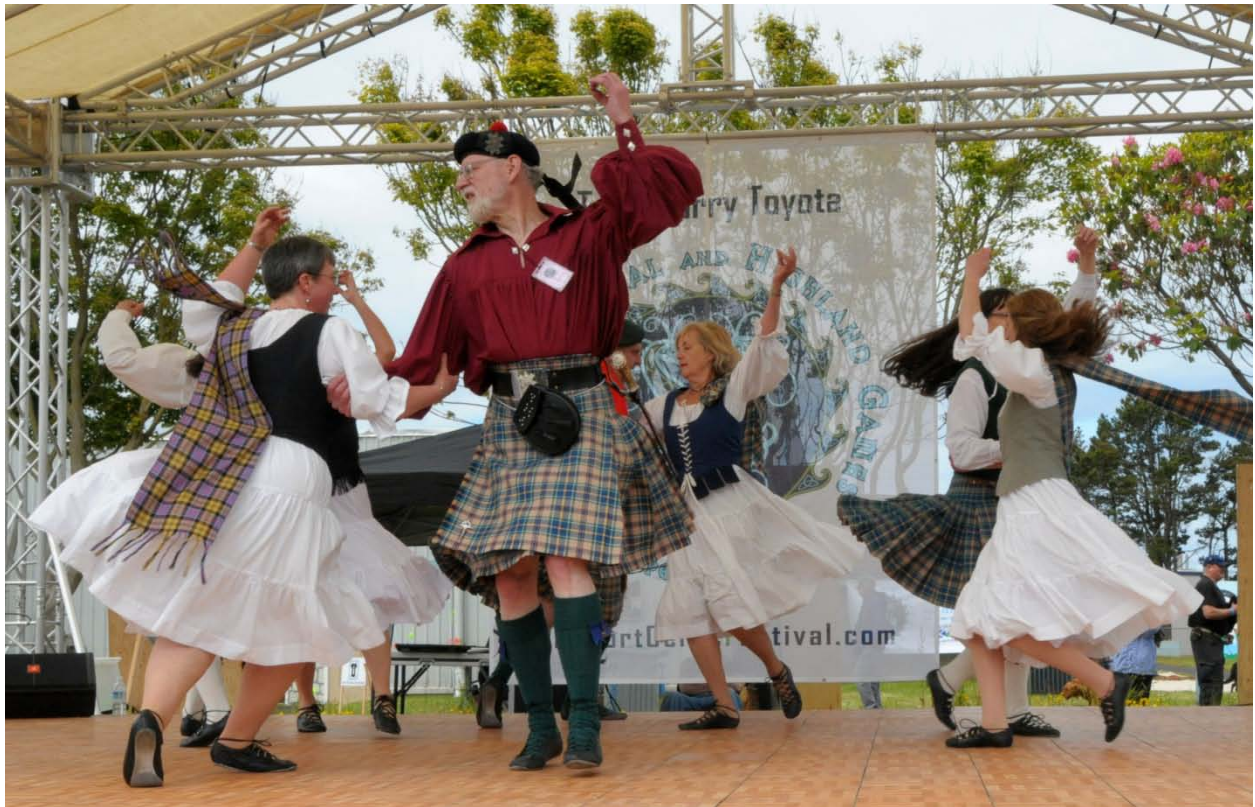
Caption: The High Desert Scottish Celtic Dancers demonstrate Scottish Country Dancing at the 2012 Newport Celtic Festival & Highland Games.