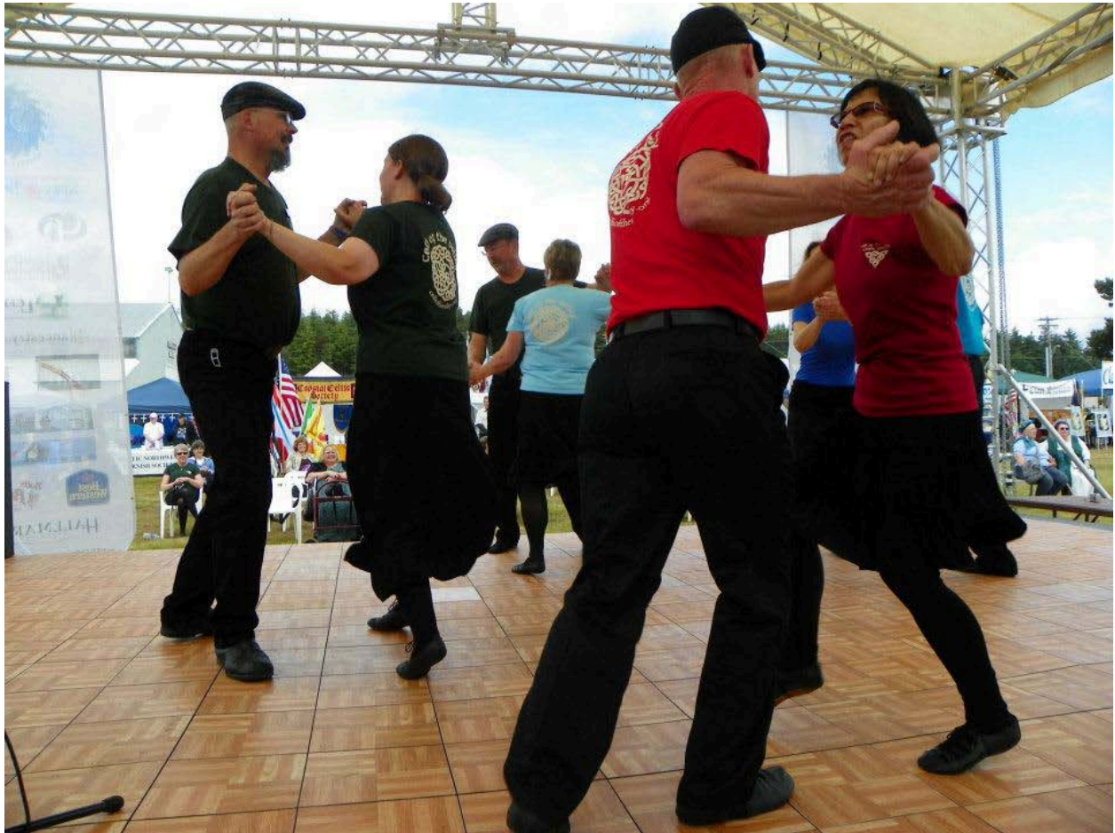
Caption: The Céilí of the Valley Society (Salem, OR) demonstrates Traditional Céilí Dance moves at the 2012 Newport Celtic Festival & Highland Games.