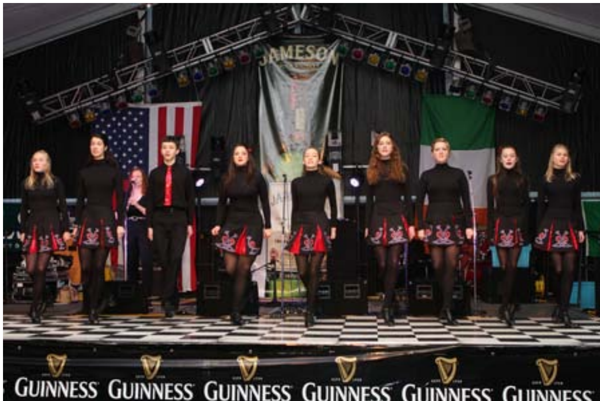
Caption: Colorful dancers from the Murray School of Irish Dancing demonstrate traditional Irish Step Dancing.