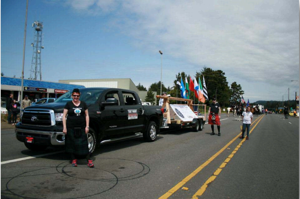
Volunteers escort the "Clan MacLaren Challenge Caber" during the annual Loyalty Days Parade - May 2012

Photo Courtesy: B. Goody (Waivers and Authorizations have been completed for use.)